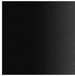
101 FT black fine textured