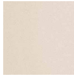
109 FT champagne fine textured